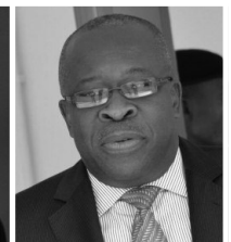
Oti Ikomi Proton Energy