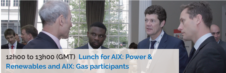
12h00 to 13h00 (GMT) Lunch for AIX: Power & Renewables and AIX: Gas participants

AIX: Gas delegates have access to the following AIX: Power & Renewables energy transition sessions as well as the evening reception at RSA House on 17 November.