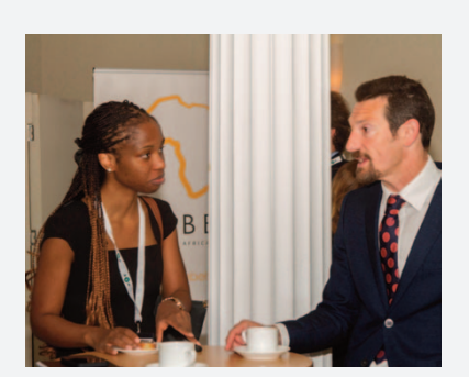
Coffee breaks sponsor 6 coffee breaks including before plenary session